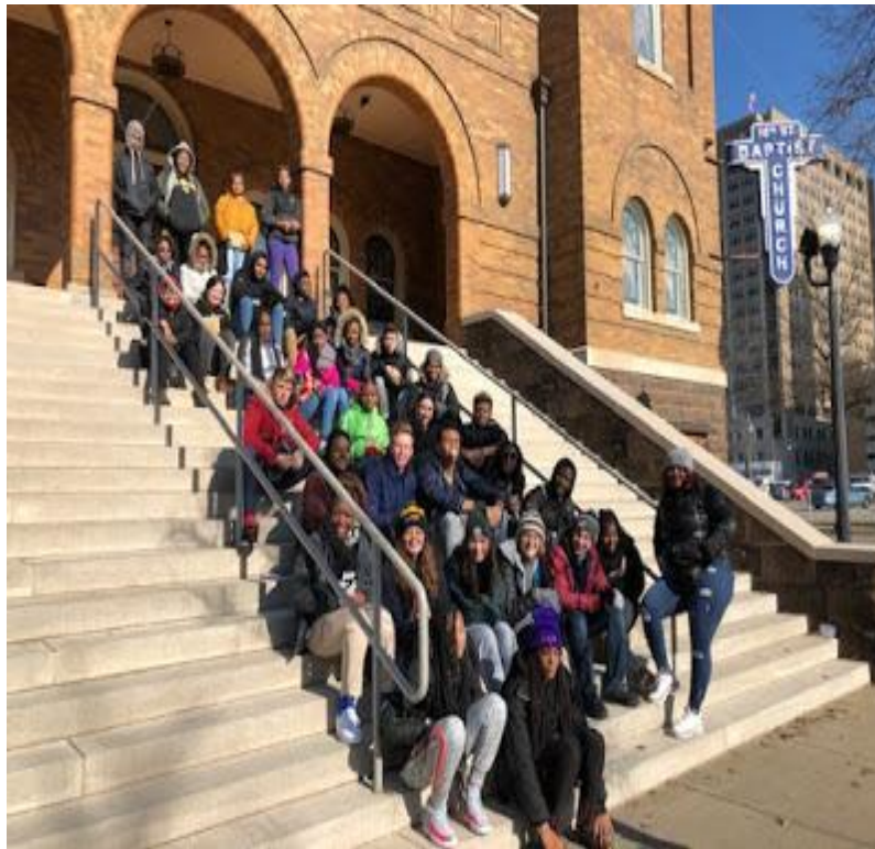
Students on the steps of the 16th Street Baptist Church