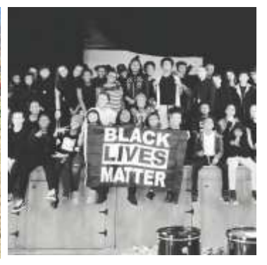
City Neighbors Charter School and City Neighbors Hamilton students participate in the National School Walkout in March.